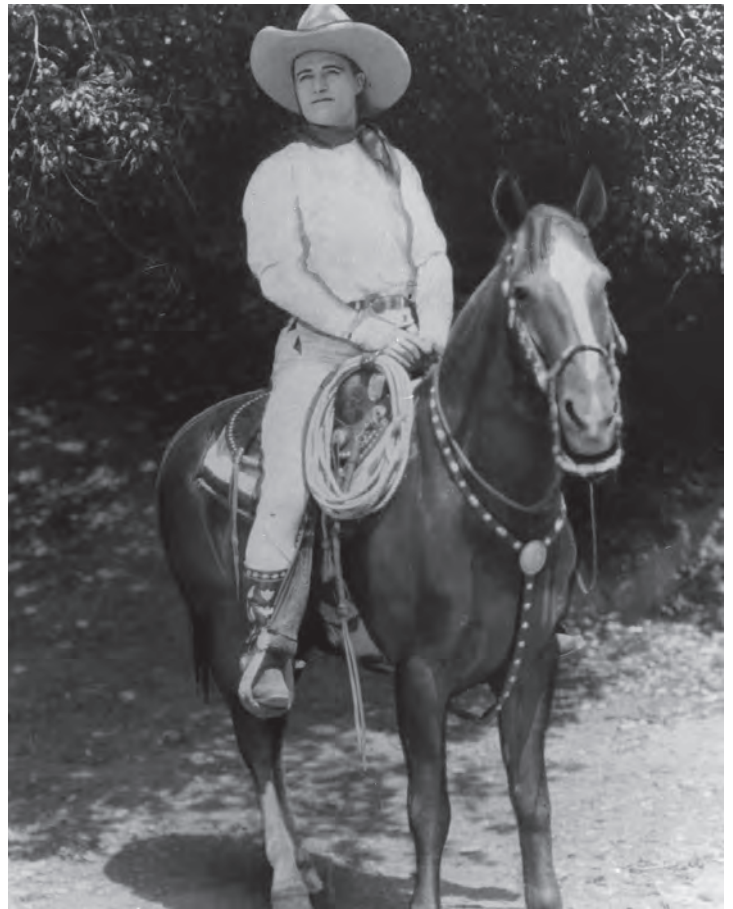
Tom Mix on Tony the Wonder Horse, filming near Prescott on the rail line near Yeager Canyon, "The Texan" was released in 1920. Featured in the film was Bradshaw Mountain Locomotive #52 a local steam engine which was used in many films.

The entire list of celebrities, which include actors, lecturers, musicians and singers from afar, magical movie memories, organizations, politicians and Prescott personalities, may be accessed on the Elks Opera House Foundation's website: elksoperahousefoundation.org . Phone contact may be made at 925.445.1298. Celebrity seats are $500 and the name honored will appear in a plaque on the arm of the new seats to be installed in the near future.