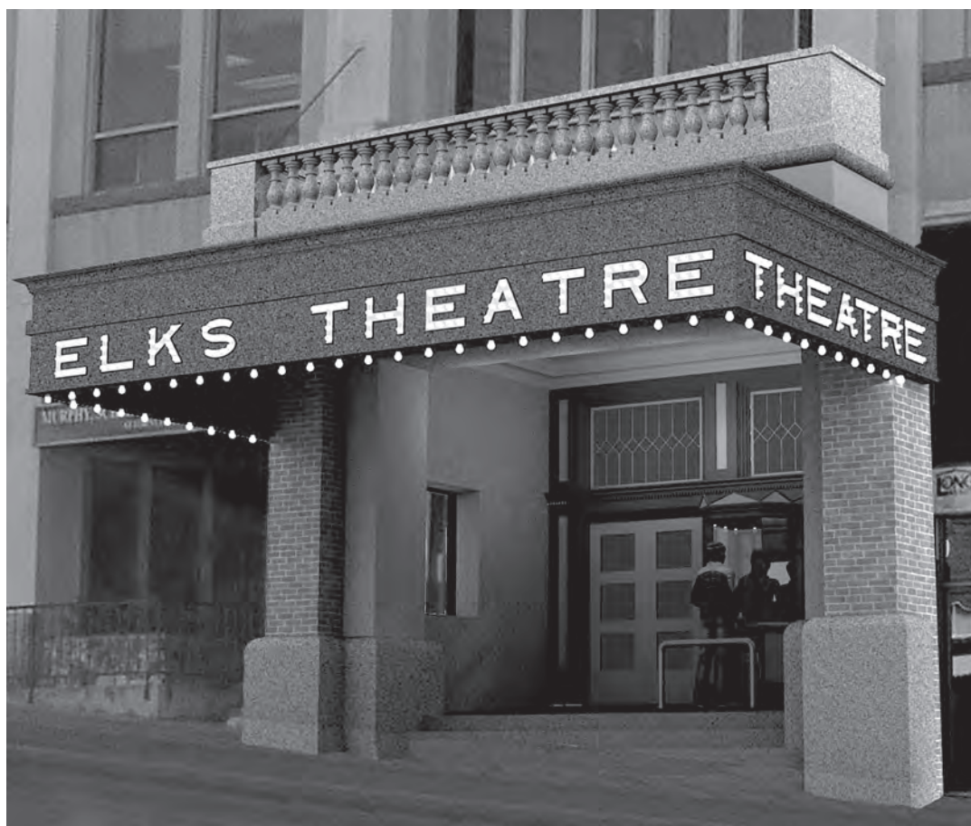
Façade at the completion – computer assisted design provided by Otwell Associates Architects

Non-Profit Organization U.S. Postage PAID Permit No. 9 Prescott, AZ